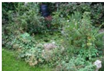
Millstream Fork wildlife garden.

We need to monitor dragonflies that are already on the brink of extinction. We also need to conserve their habitat, and to recreate the best possible living conditions wherever possible. Unfortunately, time is running out every year and it is no longer possible to guarantee the survival of every species.